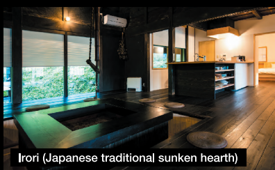
Irori (Japanese traditional sunken hearth)