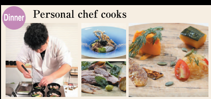
Dinner Personal chef cooks