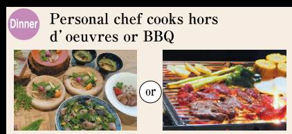
Dinner Personal chef cooks hors d'oeuvres or BBQ